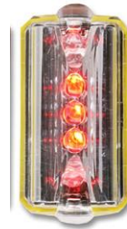
BLINKING LED TAILLIGHT